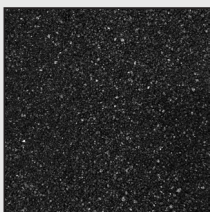
Iron Black (BK8A)