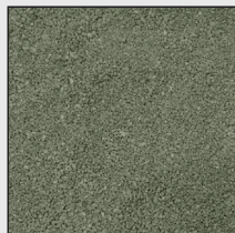
Slate Gray (GY6A)