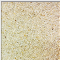
Natural Sand (TN9A)