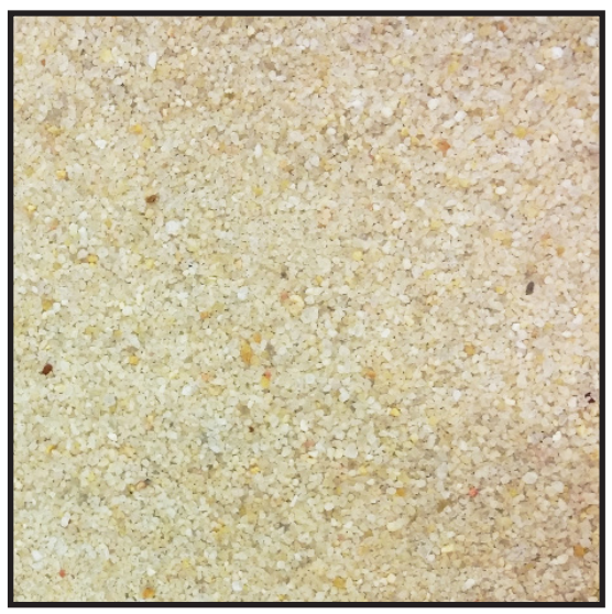
Natural Tan (TN9A)

Color charts have been optimized to show colors as accurately as possible. Due to screen and printing limitations, you should consult your local Wolverine Coatings Corporation representative when color is critical or if custom colors or matching is desired.