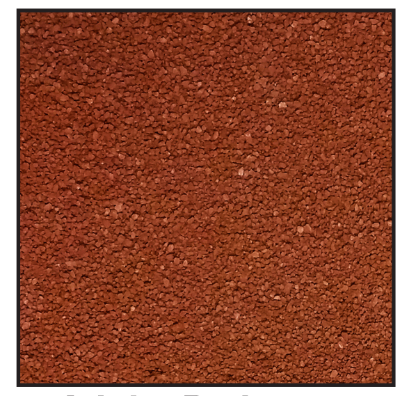
Adobe Red (RD3B)